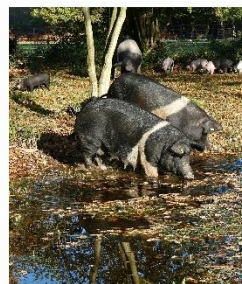
Landford Parish Directory 2020/2021